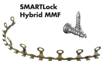
SMARTLock Hybrid MMF

Assistant Professor and Program Director Department of Oral and Maxillofacial Surgery University of Pittsburgh