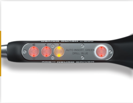
Error indicator Allows the user to troubleshoot based upon real time visual feedback