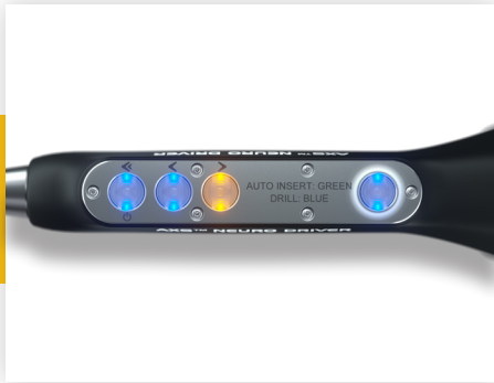
Continuous drill mode Blue lights indicate AXS™ Neuro Driver is in non-torque limiting/drill mode

The AXS Neuro Driver is programmed with a smart algorithm to sense when a screw has been inserted and stops at the optimal time. You retain full control if you need to stop sooner, simply release the button.