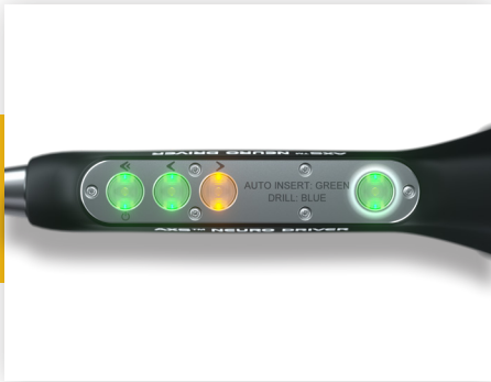
Auto insertion screw mode Green lights indicate AXS™ Neuro Driver is in auto insert mode for screw insertion